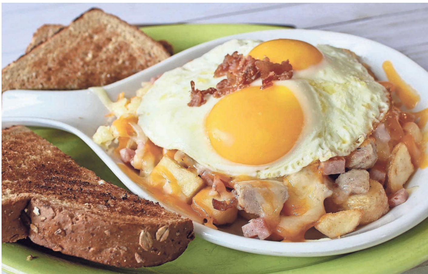
A Scramblers customer favorite: Uncle Moose's Manhandler Skillet with bacon, ham, sausage, onions and a blend of monterey jack and cheddar cheeses on a bed of skin-on potato chunks then topped with two eggs any style.