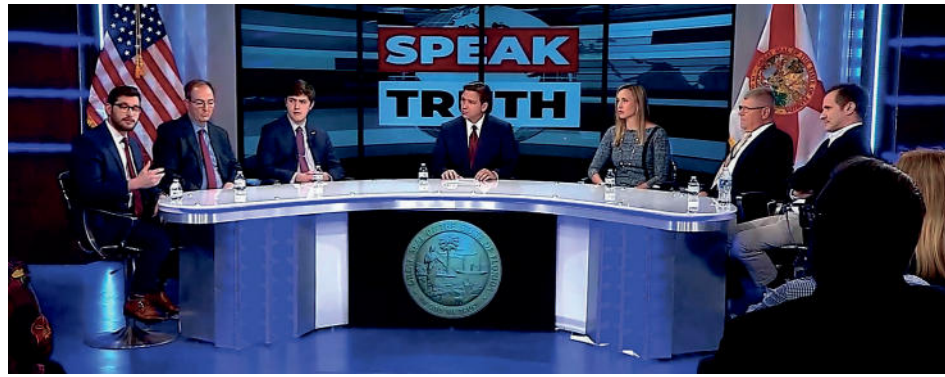
Gov. Ron DeSantis hosted a roundtable discussion on defamation on Tuesday.

that has alarmed some First Amendment advocates and appeared aimed at a national audience, DeSantis said he wants to make it easier to sue media outlets that he claimed were society's "leading purveyor of disinformation."